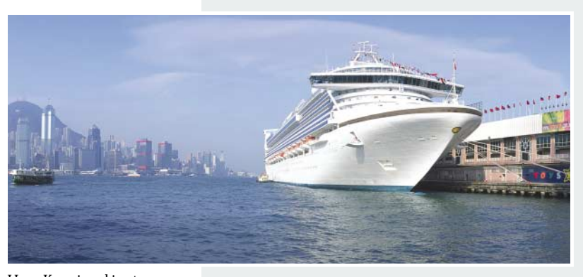
Hong Kong is seeking to become Asia's leading cruise hub 香港致力成為亞洲首屈一指的郵輪樞紐

The Chairman has already referred to the importance of the high-yield business and family segments in her message. The year also saw considerable growth in the conventions, exhibitions and corporate events market, with significant increases not only in the number of participants, but also in their per capita spending, and the number of major events held in the city. In co-operation with the commercial sector and other related bodies, the HKTB expended considerable effort throughout the year to promote jointly and enhance Hong Kong's position in gaining a larger share of this particularly high-yield segment. The Hong Kong Convention, Exhibition and Corporate Events Marketing Forum was established in December 2002 to co-ordinate local efforts to attract further international events to the city.