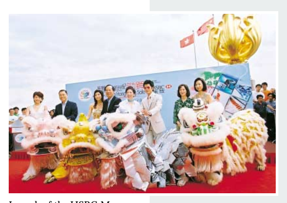
Launch of the HSBC Mega Hong Kong Sale 滙豐香港新世紀勁買 啟動儀式

A parallel trend towards "same day in-town" visitors who did not spend a night in the city also persisted, accounting for 35.4% of visitors in 2002, compared with 35.2% in the previous year. Such a trend is inevitable, given Hong Kong's increasing importance as a regional aviation hub and a major gateway to China. The HKTB's challenge is to maximise satisfaction and spending during these brief visits, and to create the potential for longer-stay leisure visits in the future.