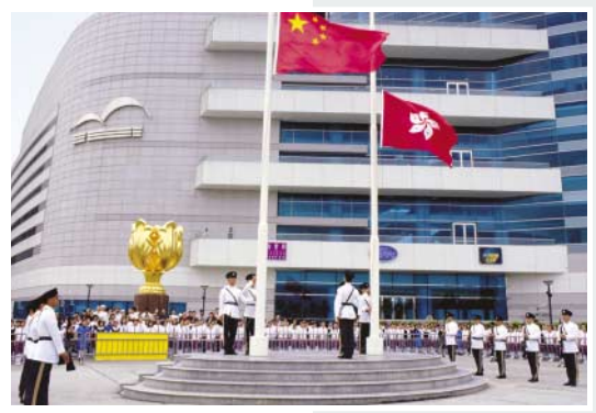
The flag raising ceremony at Golden Bauhinia Square has become a popular tourist activity

As a world-class destination in an increasingly competitive global environment, Hong Kong must not only respond to changing visitor demand and provide the appropriate tourism infrastructure, but it must also continually strive to deliver consistent and unmatched standards of service. The HKTB has worked hard to ensure that all visitors enjoy a most delightful and memorable experience from the moment they arrive until the time they leave, with such initiatives as the Quality Tourism Services (QTS) scheme, launched in 1999 and further enhanced since; the Tourism Orientation Programme (TOP), which began in May 2002; and other programmes and services undertaken by our partners and associates.