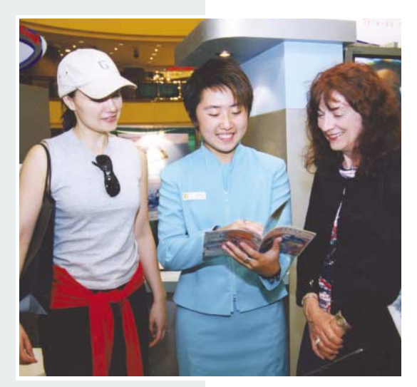
Organised by the HKTB, the Tourism Orientation Programme offers two one-year orientation programmes for 200 people interested in a career in tourism 旅發局舉辦的「旅業英才 實習」計劃,為期兩年, 每年培育200位有志投身 旅遊業的人才

另一方面,《旅行代理商(修訂)條例草案》在2002年11月1日正式生效,旅發局就此表示歡迎。這條例為保障入境旅遊團而設,規定經營到港旅遊業務的代理商必須申領牌照,遵守由香港旅遊業議會訂定與經營出境旅遊業務的代理商相同的專業守則,為參團來港的旅客提供協助和支持,並要不斷提升服務水平。