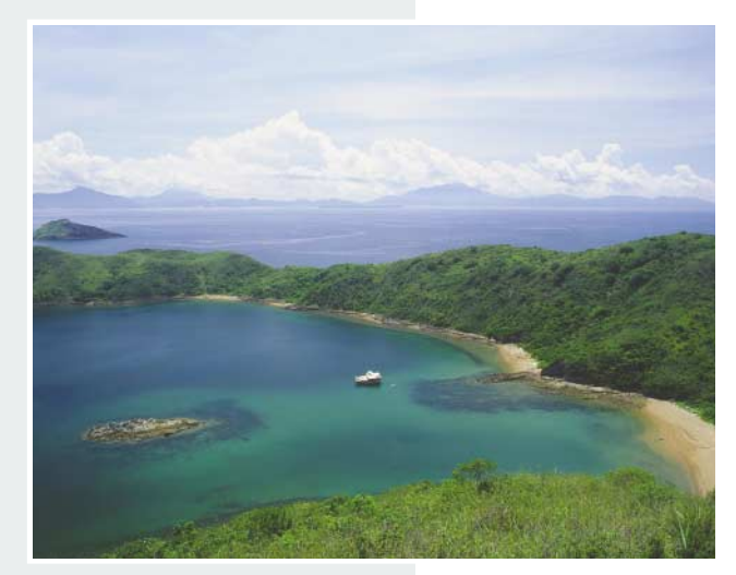
Hong Kong offers unique and growing opportunities for green tourism 香港的綠色旅遊擁有獨特而且不斷增加的發展機會

香港是通往亞洲和內地的門戶城市,這個策略性地理位 置為香港帶來龐大的裨益。然而,為維持我們的競爭優勢,我們仍會繼續與亞洲區內其他旅遊目的地合作,針 對短途和長途市場組成不同的策略聯盟。